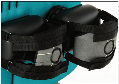
Caliper style kneecaps CODE KN017 - KN019 Extra knee support Maintains knee position Available in sizes 1 - 3