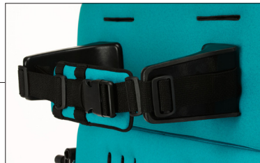
Lateral & pelvic supports