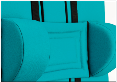
Soft head support CODE SP006 – SP007 Helps to support head position