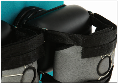
Popliteal foams (half thickness) CODE FM015 Provides support to the back of knee