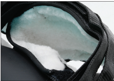
Sheepskin liners CODE KN022 - KN024 Maintains position of knee with added protection Available in sizes 1 - 3