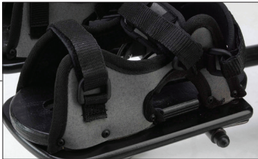
Footrest & cocoon sandals