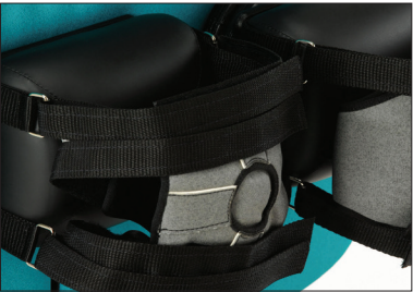
Popliteal foams (full thickness) CODE FM014 Provides support to back of knee