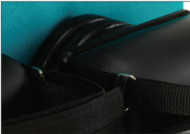
Kneecap spacers CODE KN020 - KN021 Provides additional height to the popliteal pad to accommodate differing degrees of knee contraction