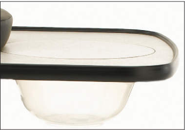
Bowl and cover 1 CODE BW006 & BW007 Perfect for wet or dry play activities