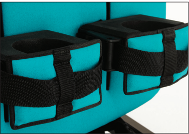
Knee cups CODE KN011 - KN016 Maintains knee in position Available in sizes 1 - 6